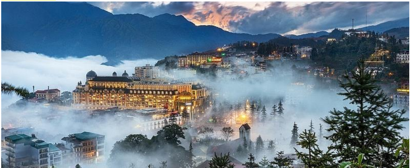
The overview of Sapa town