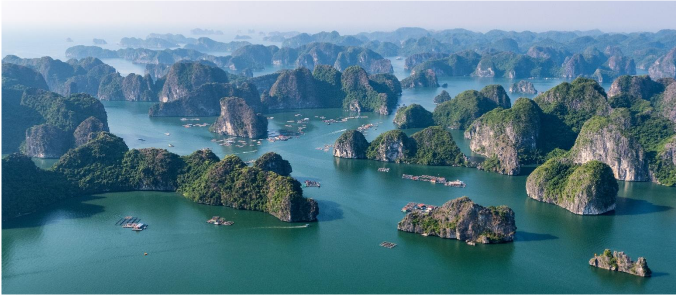
The overview of Halong Bay