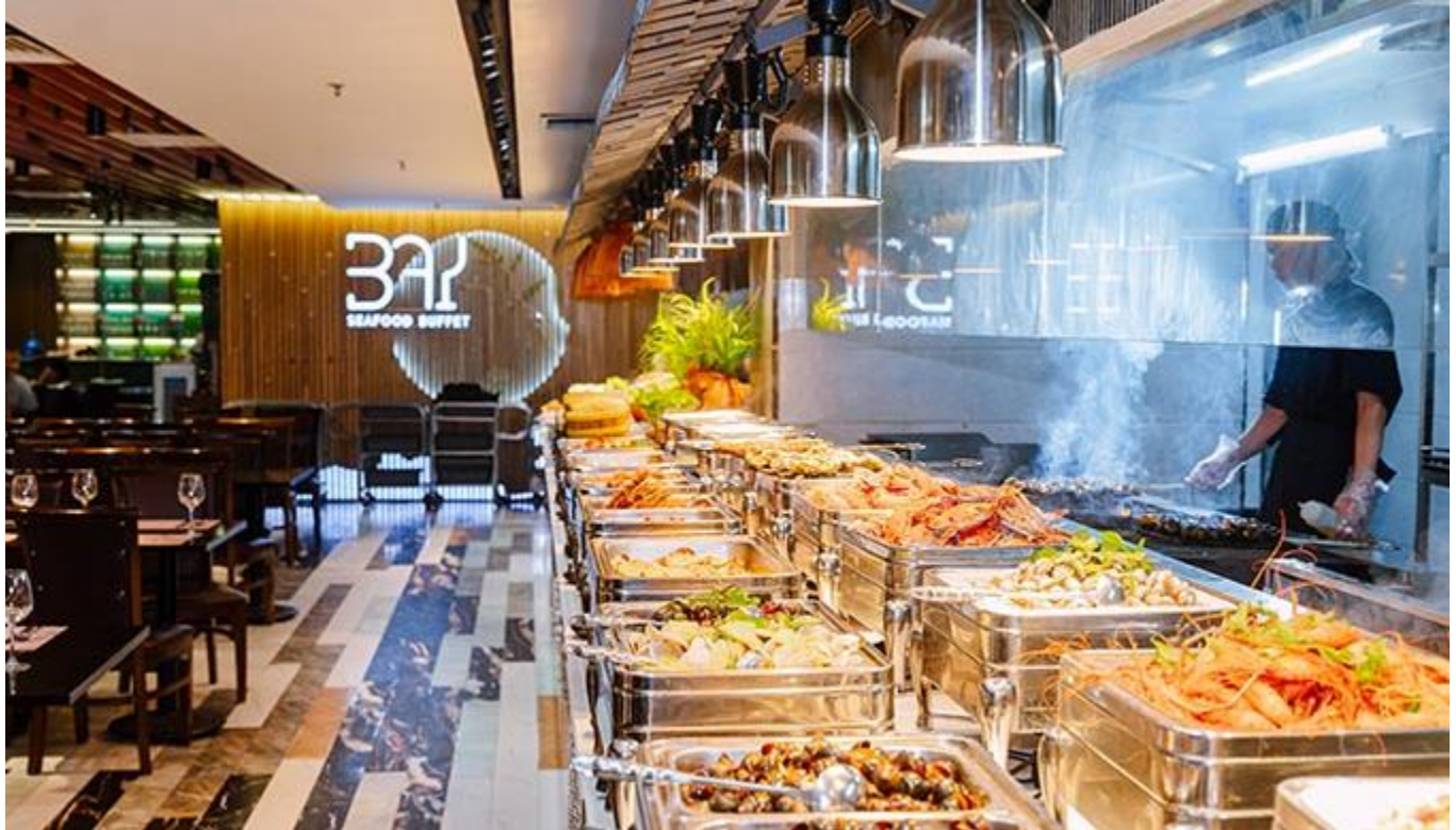
Buffet Bay in Hanoi