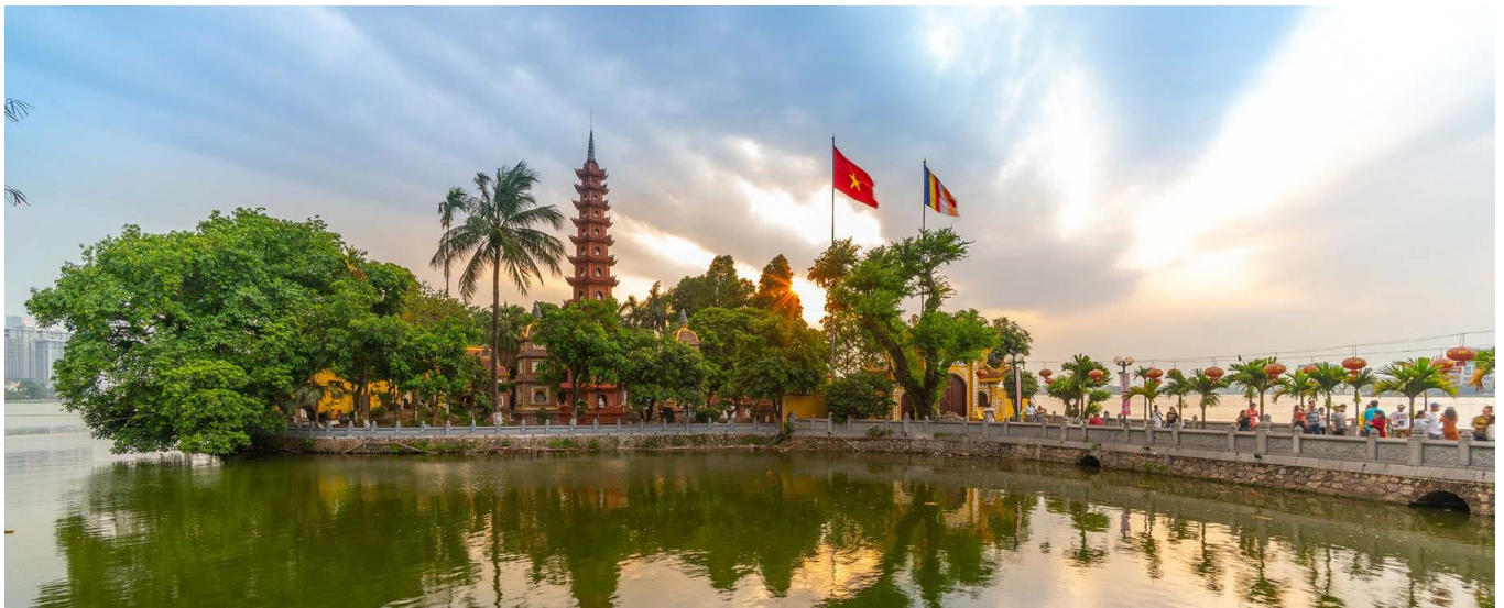
Tran Quoc Pagoda