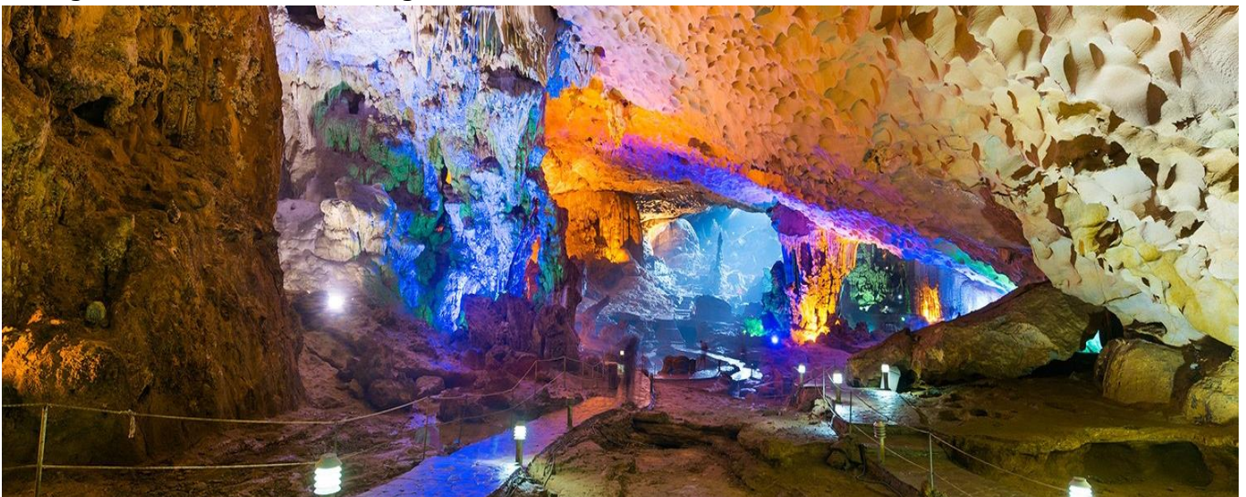
Thien Cung Cave

Having brunch before disembarking and transfer back to Ha Noi.